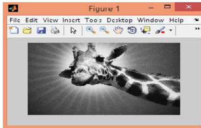
Fig. 3: Grayscale image