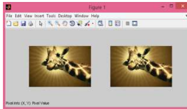
Fig. 5: 8 bit to 16 bit conversion