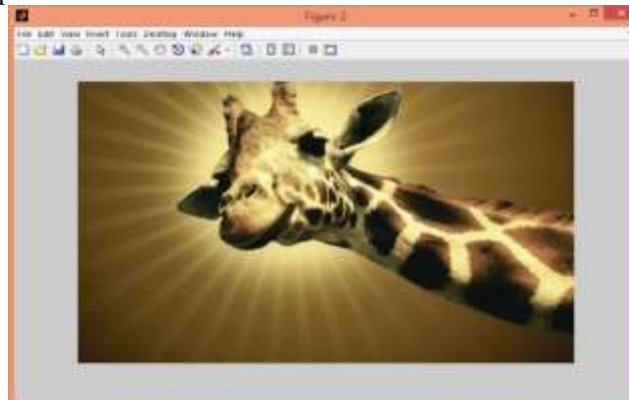
Fig. 2: Original image

Following are the result of sobel operator: