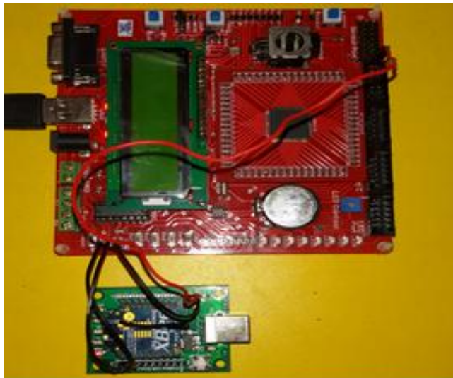
Fig. 2: Sensor Node

Figure 3 shows the Atmega 64 based sensor node. For experimental evaluation purpose temperature and two LDR sensors were interfaces with Atmega 64 development board.