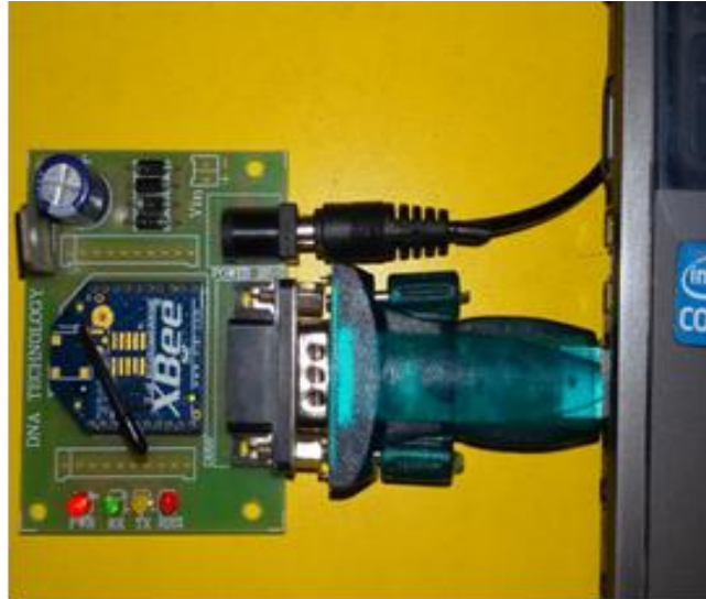
Fig. 1: Router Node at Server End