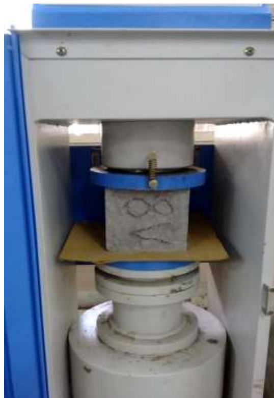
Fig. 2: compression test