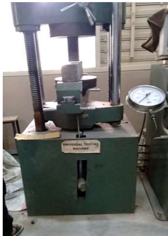
Fig. 4: Flexural test