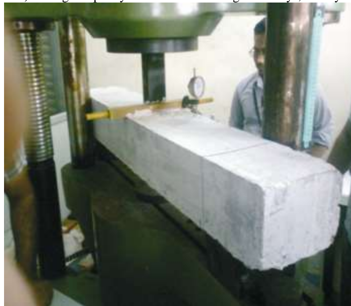
Fig. 1: Testing of beam

Compressive strength and flexural strength of the concrete measured using 150mm x150mm x 150mm cubes and 150mm x150mm x 1000mm beams. All the cubes and beams were cast in three layers and each layer was fully compacted by using a needle vibrator for beam and a vibrating table for other specimen. Compressive strength of the cube was measured by compression testing machine (CTM) having a capacity of 2000KN at the age of 7 days, 14 days and 28 days.