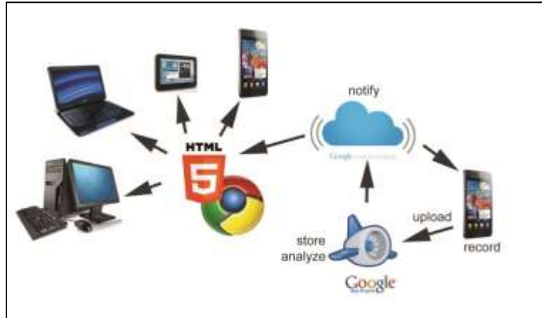
Fig. 4: Data flow of Experimental setup

Sensor data collection starts as soon as the app starts. Data of temperature and humidity sensor is recorded. Collected sensor data is stored in local database on the phone (Android has built-in support for SQLite database), and the reported data will also be stored in text format. Communication statistic data is collected from Android system log before the upload operation. Data uploading happens automatically when the phone has a valid WIFI Internet connection. If the phone has not connected to WIFI network for a whole day, the data will then be saved on the phone until the time the WIFI connection is available.