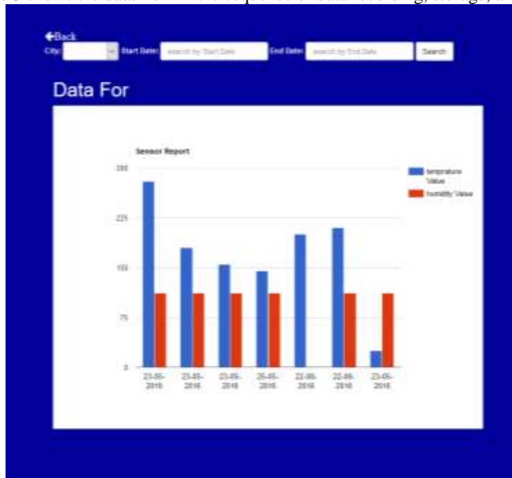
Fig. 3: Report Analysis Screen

We performed a case study to evaluate the feasibility of the proposed mobile cloud framework as shown in Figure 3. Specifically, we used a Samsung Galaxy S4 and Samsung galaxy note 3 with Android OS 4.4 to collect Temperature and humidity sensor data. We used Azure as the cloud computing platform. Azure enables software platforms to move from their traditional development environments into the cloud. Azure offers Platform-as-a-Service (PAAS), providing an ideal foundation to build robust and scalable Web applications. . Abundant APIs are available to developers to make the mobile devices work seamlessly with Azure. Figure 3 shows the data flow in the sequence of data recording, storage, analysis, and results notification.