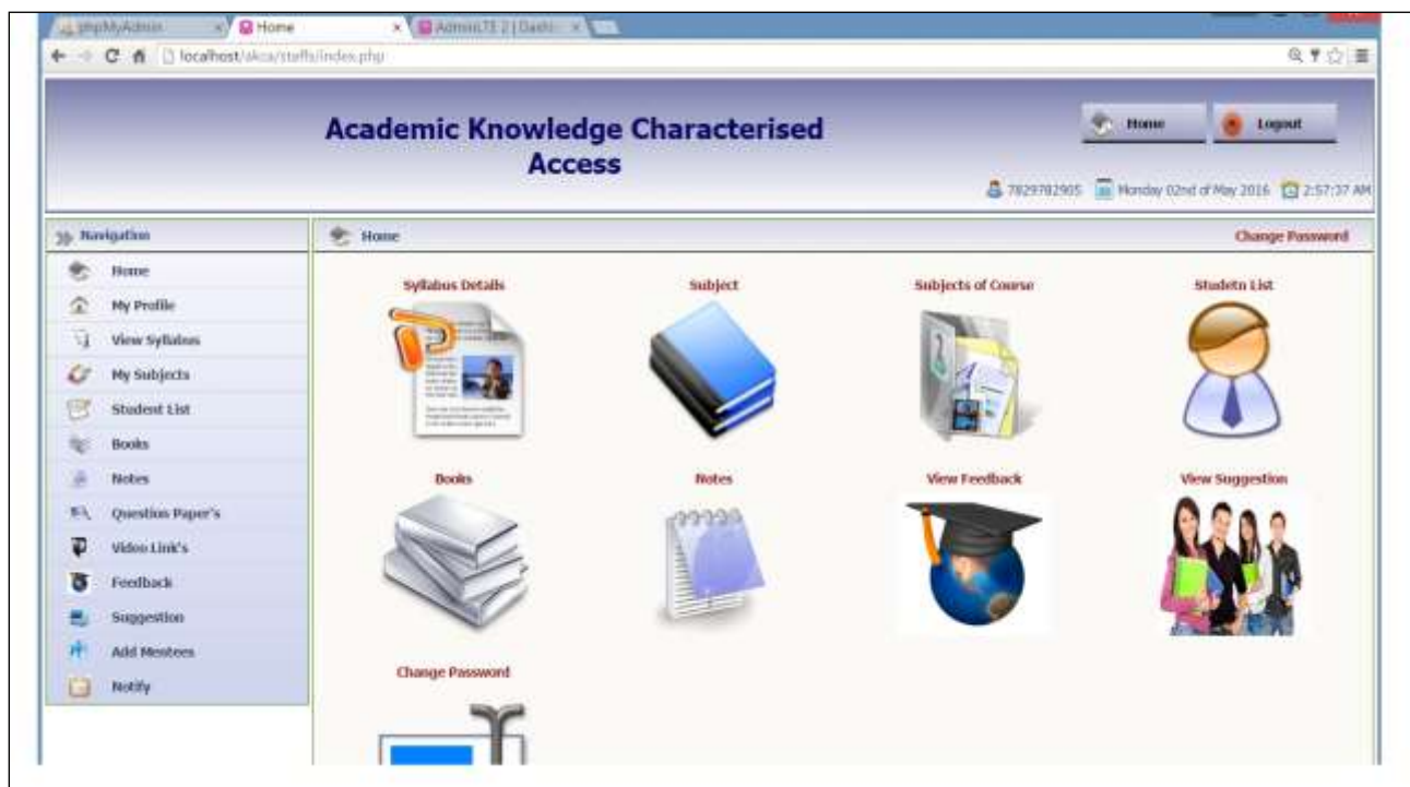
Fig. 3.3: Lecturer Menu