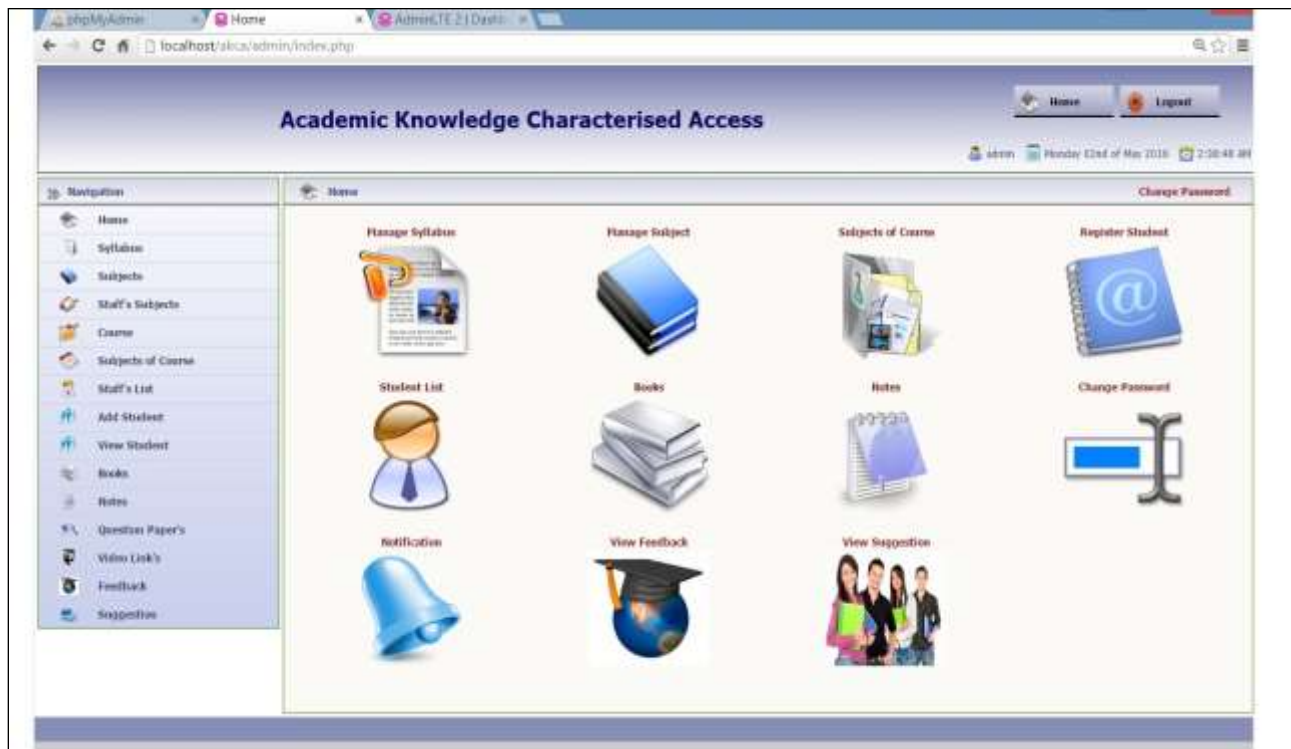
Fig. 3.2: Admin Menu