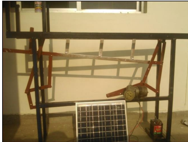
Fig. 2: Box Transport Mechanism Setup

a good look. Now all of the things for the machine are prepared. On this step we took the electric motor and fix that on the bed of the machine on the given place. After fixing the motor we fixed the crank with it from one side and other side was attached to the shaft.