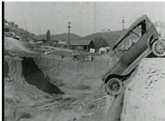
Fig. 7: Deep accident