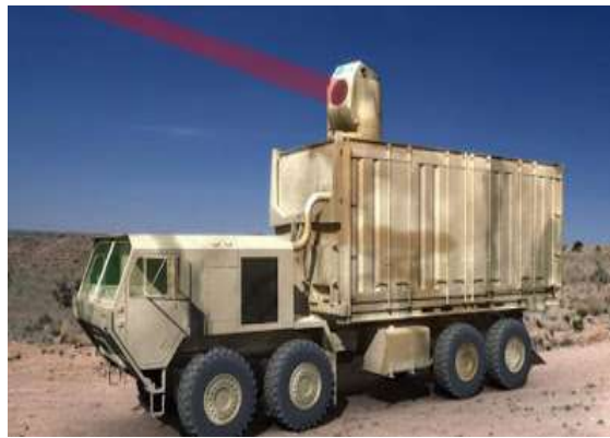
Fig. 8: Shooter LED