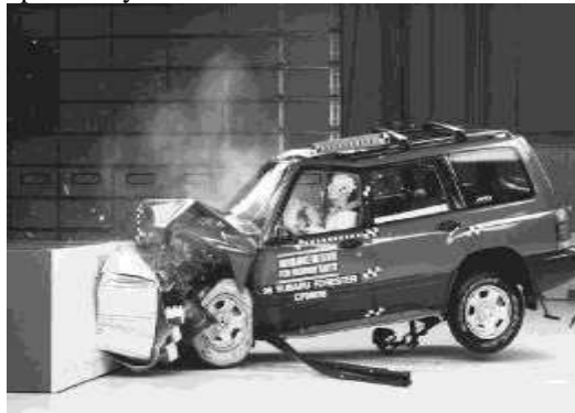
Fig. 6: Front accident