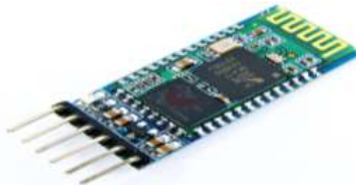
Fig. 4 : Bluetooth Module

Bluetooth is a wireless technology standard for exchanging data over short distances (using short-wavelength UHF radio waves in the ISM band from 2.4 to 2.485 GHz from fixed and mobile devices, and building personal area networks (PANs). Invented by telecom vendor Ericsson in 1994, it was originally conceived as a wireless alternative to RS-232 data cables. It can connect several devices, overcoming problems of synchronization. Bluetooth is managed by the Bluetooth Special Interest Group (SIG), which has more than 25,000 member companies in the areas of telecommunication, computing, networking, and consumer electronics. The IEEE standardized Bluetooth as IEEE 802.15.1, but no longer maintains the standard. The Bluetooth SIG oversees development of the specification, manages the qualification program, and protects the trademarks. A manufacturer must make a device meet Bluetooth SIG standards to market it as a Bluetooth device.