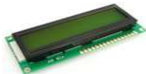
Fig. 5 : LCD

The command register stores the command instructions given to the LCD. A command is an instruction given to LCD to do a predefined task like initializing it, clearing its screen, setting the cursor position, controlling display etc. The data register stores the data to be displayed on LCD. The data is the ASCII value of the character to be displayed on the LCD. The brightness of LCD can be controlled by variable resistor. The CMOS technology makes the device ideal for application in hand held, portable, hand held & used low power consumption.