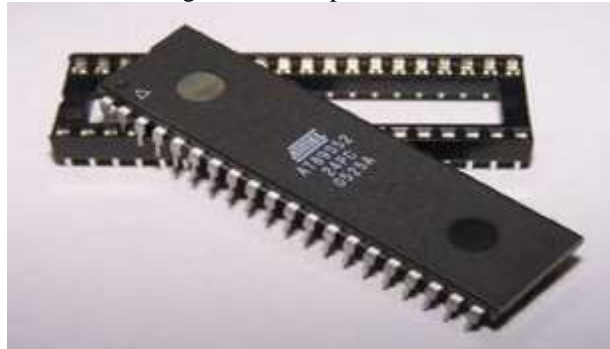
Fig. 3: Microcontroller I.C AT89S52

architecture, a full duplex serial port, on-chip oscillator, and clock circuitry. In addition, the AT89S52 is designed with static logic for operation down to zero frequency and supports two software selectable power saving modes. The Idle Mode stops the CPU while allowing the RAM, timer/counters, serial port, and interrupt system to continue functioning. The Power-down mode saves the RAM contents but freezes the oscillator, disabling all other chip functions until the next interrupt or hardware reset.